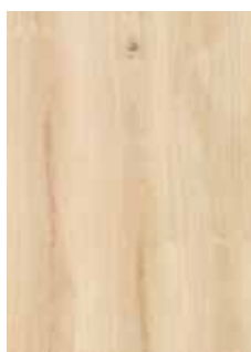
520 Halford Oak