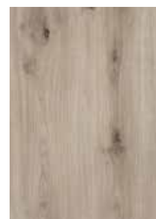
550 Bobèche Oak