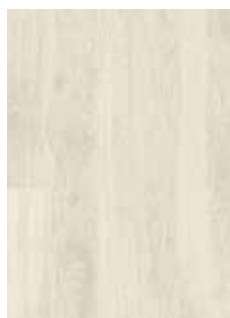
110 Left Bank Oak