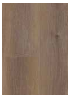
170 Galway Oak