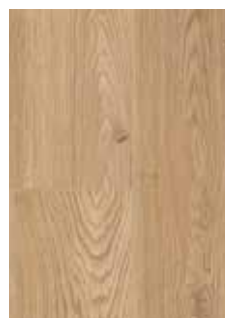
320 Varnish Oak