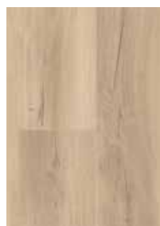
730 Besk Oak