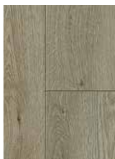
560 Newport Oak