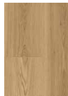
350 Universal Oak