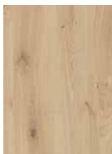
510 Mechanics Oak