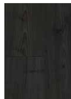
790 Foxtrot Oak

While all care is taken, product images may vary in colour due to possible printing process variations. Images are to be used as a guide only to give an idea of the colour and nuances of the pattern, but are not fully representative of the variations among the planks (which reflects the natural product which inspired the design). For a representative view of the surface structure and variations within the design, take a look at the big samples on display and ask your retailer for more advice.