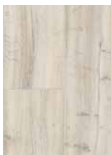
700 Royal Oak