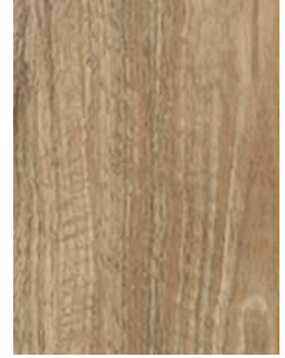
525 Silk Spotted Gum