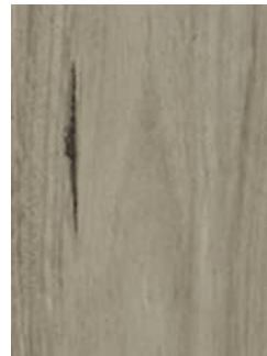
735 Stony Blackbutt