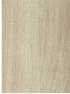
110 Pearl Oak