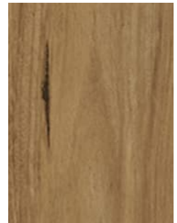
570 Tawny Blackbutt