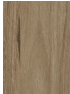
560 Hazel Blackbutt