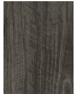
790 Iron Spotted Gum