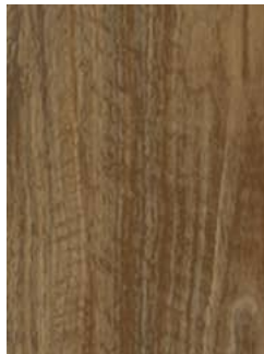
585 Brindle Spotted Gum