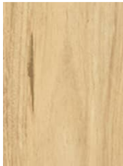
545 Classic Blackbutt