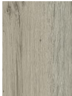
710 Silver Hardwood